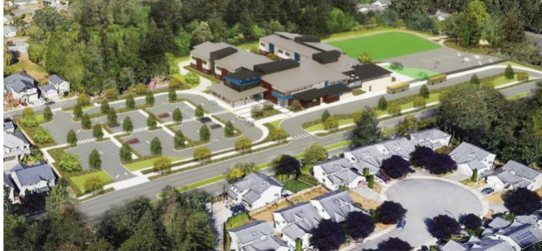
Hilltop Heritage Elementary School

Hilltop Heritage Elementary , Renton School District's newest school in the Highlands/Sunset area, is set to welcome 650 kindergarteners through fifth graders this fall. Building structural work is complete, and the building is fully enclosed. Work continues on electrical, plumbing, HVAC systems, and the parking lot.