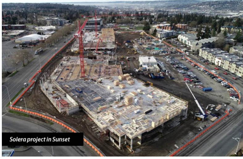
Solera project in Sunset

Look around our city, and you'll see construction cranes dotting the skyline. The city's landscape is changing because of housing, school, and retail projects.