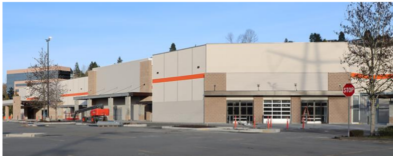
Home Depot underway.

Near Renton City Hall, two other projects are