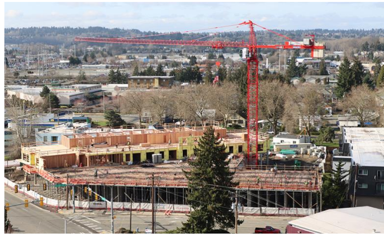
Watershed Renton Apartments

Across the street from Renton City Hall, work is proceeding on Watershed Renton Apartments (625 Williams Ave. S). The project includes 145 studio, 1, 2, and 3-bedroom apartments and first-floor retail. It will also include a public connection between S. Grady Way and Burnett Linear Park. Watershed Renton will open in early 2024.